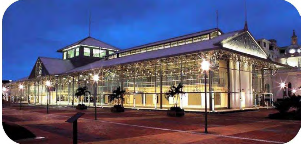
Palacio de Cristal – Semifinals venue site

The Championship Semifinals will take place at "Palacio de Cristal", located on Malecon and Olmedo Streets. It is a fantastic open area, but still covered and in the middle of the city where there are shops, restaurants and a beautiful view of the river.