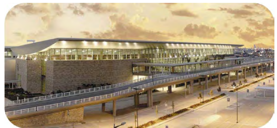
Partial exterior view of "Jose Joaquin de Olmedo" International Airport