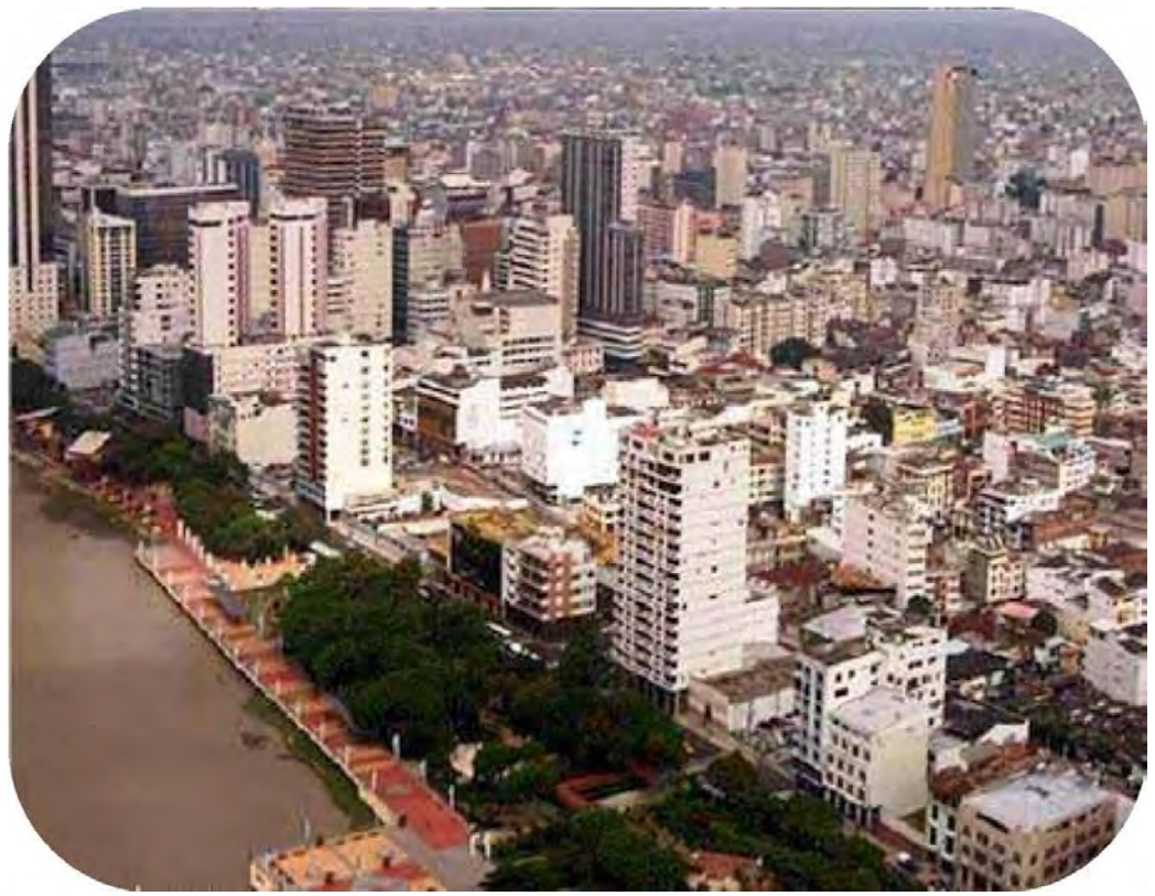
Aerial view of Downtown Guayaquil

The Organizing Committee of the Ecuadorian Bodybuilding and Fitness Federation takes this opportunity to welcome all National Federations of the world to participate in the 66th IFBB Men's World Amateur Bodybuilding Championships and International Congress in Guayaquil, Ecuador, 6th to 11th November 2012.