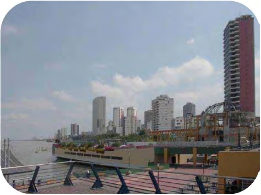
Partial view of Guayaquil's Port

The "Jose Joaquin de Olmedo" International Airport has served the city of Guayaquil since 2006. It is expected to reach an annual capacity of 5 million passengers soon. It connects Guayaquil with many countries and was named "Best Airport in Latin America 2008" by Business Week Magazine.