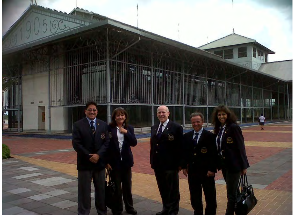
Palacio de Cristal - Semifinals venue site - Inspection Visit