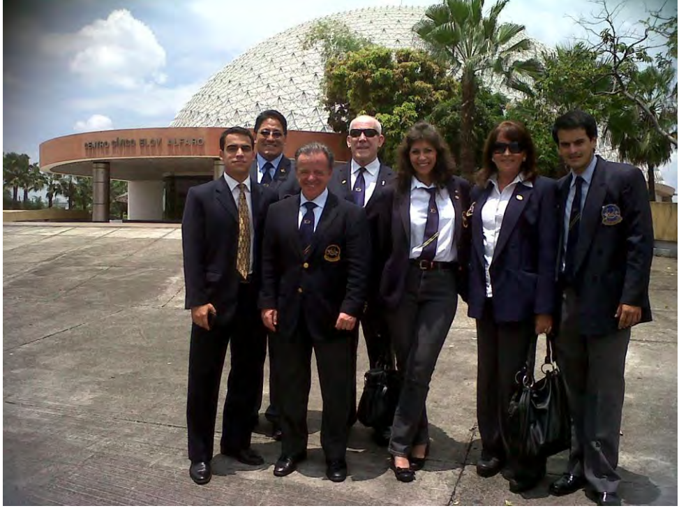
Eloy Alfaro Theater – Finals venue site – Inspection visit

The Finals will take place in the beautiful theatre "Teatro Centro Civico Eloy Alfaro", located on Bolivia Street and Quito Avenue. A theatre well suited for the championships.