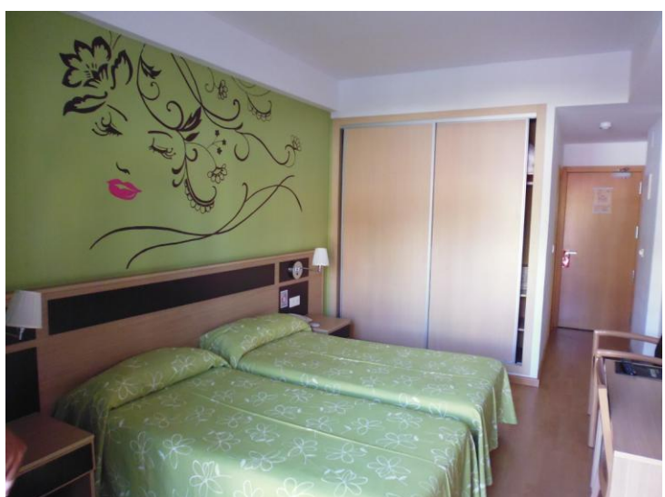
Room at "Hotel Golden"

Complementary Hotels are "Golden" and "Marconi", both located around 80 metres from "Magic Villa del Mar", are also in the Poniente Beach.