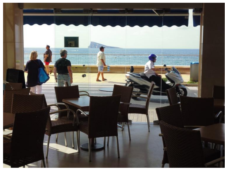
View from "Marconi" Hotel.

The three official Hotels, "Marconi", "Golden" and "Magic Villa del Mar", are located in the main comercial street of Benidorm, in a safety and fun touristical area of Benidorm city, not more than 8 km from venue site in La Nucia.