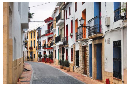
Street in La Nucia

La Nucia is located in a fruit valley between Benidorm and Callosa d'En Sarrià, 3 km from the coast of Altea. The urban center is on a promontory overlooking the Mediterranean Sea, 51 km north of Alicante Airport and 8 km north of Benidorm. Population (with over 80 different nationalities, mainly europeans) are 17.000 citizens.