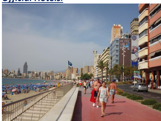
Hotel "Magic Villa del Mar****"

The 4 Stars (****) Hotel "Magic Villa del Mar" will be the main official hotel and is located in the "Poniente" beach of Benidorm, at Avenida Armada Española , 1, 03500 Benidorm, Alicante.